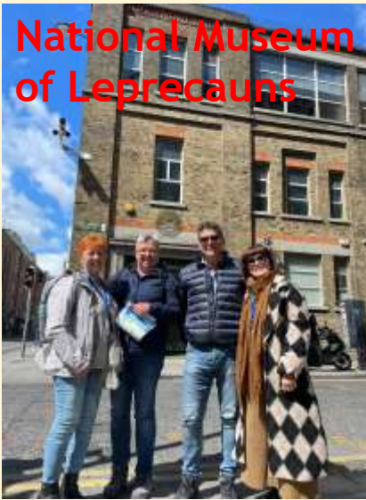
National Museum of Leprecauns