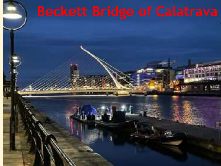
Beckett Bridge of Calatrava