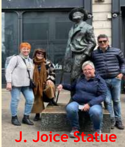
J. Joyce Statue